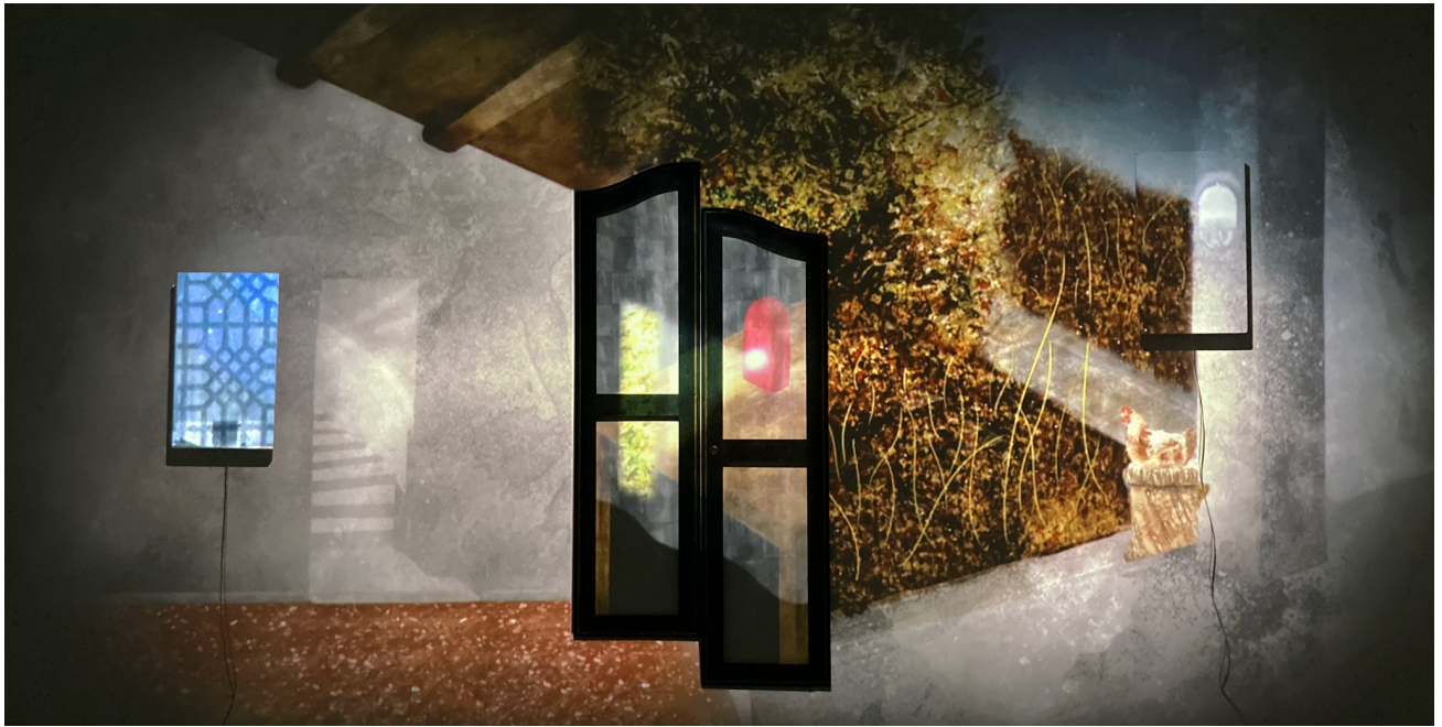
Tara Aliya Kesavan & Indranil Choudhury, Installation view of Current Occurrences , 2022.